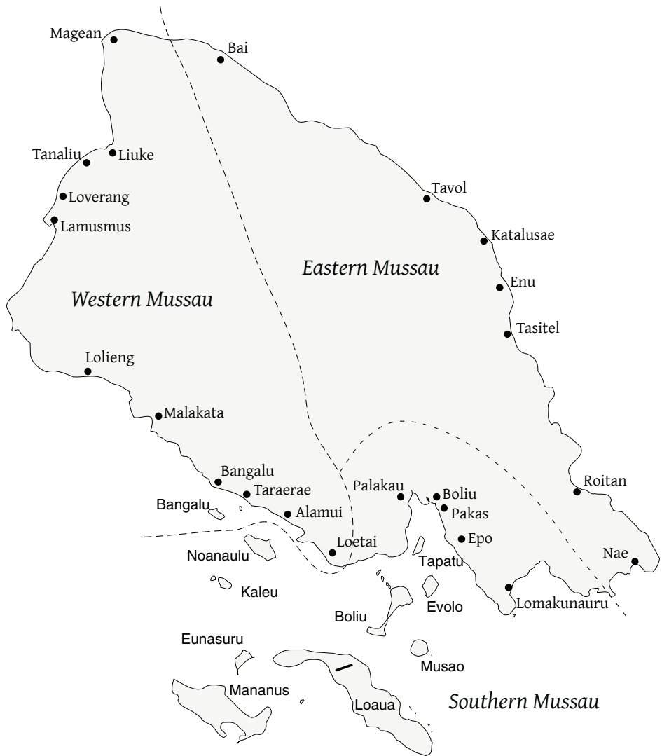
Map 3: Mussau Dialects