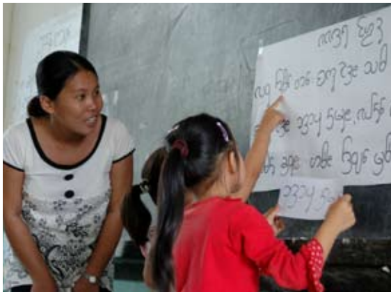
Learning to read occurs most easily in the language the learner speaks best.

Primary education programs that begin in the mother tongue help students gain literacy and numeracy skills more quickly. When taught in their local language, students readily transfer literacy skills to official languages of education, acquiring essential tools for life-long learning. The results are the growth of self esteem and a community that is better equipped to become literate in languages of wider communication.