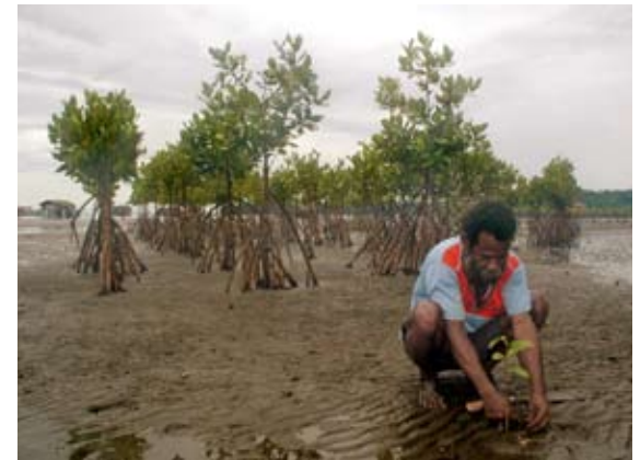
During a mother-tongue-based development project, the people of Ambai village in Papua, Indonesia, learned that clearing the mangrove areas had resulted in soil erosion.

Environmental preservation principles are communicated through literature in language-based development programs. As local populations learn appropriate technology while drawing on traditional knowledge of flora and fauna, they meet economic needs while protecting the environment.