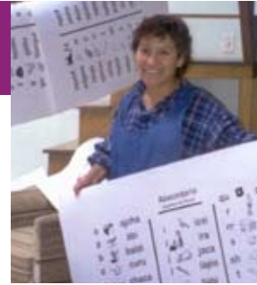
Quechua alphabet and word charts help students grasp literacy concepts even when used in Spanish-taught classrooms.

Language-based development is a series of ongoing planned actions that a language community takes to ensure that their language continues to serve their changing social, cultural, political, economic and spiritual needs and goals.